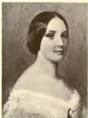
MRS. JEFFERSON DAVIS.